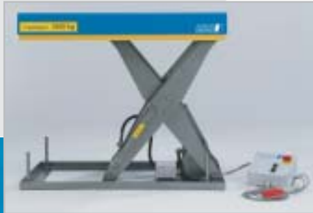
For further details of optional accessories please see page 53