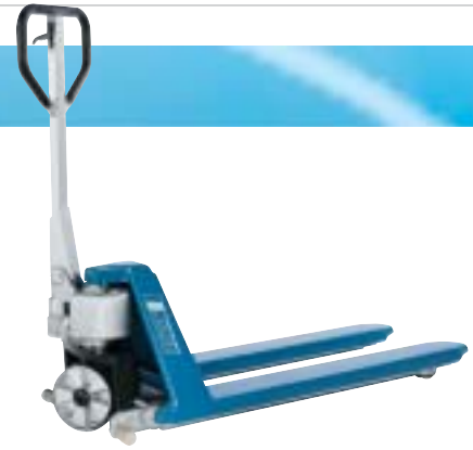
silverblau HIGH LINE HU 10-XP